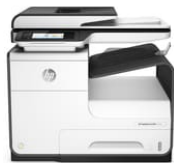
HP PageWide Pro 477dw Multifunction Printer