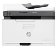
HP Color Laser MFP 179fnw