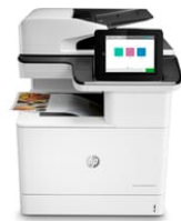
HP Color LaserJet Enterprise MFP M776dn