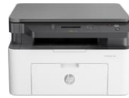
HP Laser MFP 135a

Winning in business means working smarter. The HP Color LaserJet Pro MFP M479 is designed to let you focus your time where it's most effective-growing your business and staying ahead of the competition. W1A78A