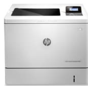
HP Color LaserJet Enterprise M552dn