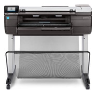
HP DesignJet T830 24-in Multifunction Printer