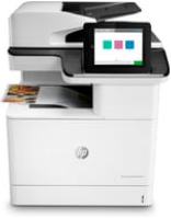
HP Color LaserJet Enterprise MFP M776dn

Expect brilliant colour prints from advanced MFPs, equipped with JetIntelligence technology. Offering HP's most secure printing 7 and a wide range of paper handling features, this is printing that helps save time and simplifies workflows. T3U55A