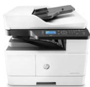
HP LaserJet MFP M443nda

Surpass your office printer expectations with the speed, quality, and efficiency of HP LaserJet office printers. 8AF72A