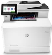
HP Color LaserJet Pro MFP M479fdw

Winning in business means working smarter. The HP Color LaserJet Pro MFP M479 is designed to let you focus your time where it's most effective-growing your business and staying ahead of the competition. W1A79A