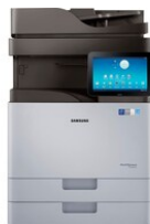
Samsung MultiXpress SL-K7400LX Laser Multifunction Printer