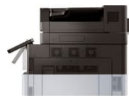
Samsung MultiXpress SL-K7600GX Laser Multifunction Printer