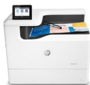
HP PageWide Color 755dn