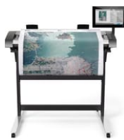
HP HD Pro 42-in Scanner