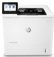
HP LaserJet Enterprise M612dn