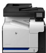
HP LaserJet Pro 500 color MFP M570dn

Surpass your office printer expectations with the speed, quality, and efficiency of HP LaserJet office printers. 8AF72A