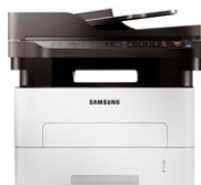
Samsung Xpress SL-M2885FW Laser Multifunction Printer