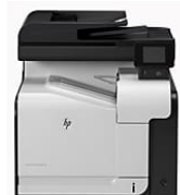
HP LaserJet Pro 500 color MFP M570dw