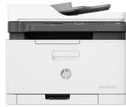
HP Color Laser MFP 179fnw

Get productive MFP performance – world's smallest colour laser in it's class. 29 Print, scan, and copy, produce high-quality colour results, and print and scan from your phone. 26 4ZB96A