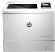
HP Color LaserJet Enterprise M553n

Speed and colour are the perfect pair for your business. That's why this energy-efficient printer and Original HP Toner cartridges with JetIntelligence combine to produce vibrant, professional-quality documents right when employees need them. B5L25A