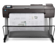
HP DesignJet T730 914-mm Printer