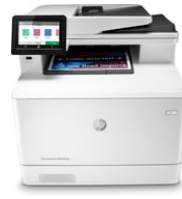
HP Color LaserJet Pro MFP M479fdn

Winning in business means working smarter. The HP Color LaserJet Pro MFP M479 is designed to let you focus your time where it's most effective-growing your business and staying ahead of the competition. W1A77A