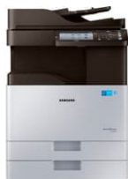
Samsung MultiXpress SL-K3300NR Laser Multifunction Printer