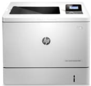
HP Color LaserJet Enterprise M553dn

As business accelerates, workgroups need to stay ahead. That's why HP designed this affordable, energy-efficient printer, with Original HP Toner cartridges with JetIntelligence, to produce professional-quality colour documents quickly and easily. B5L23A