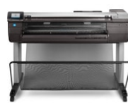
HP DesignJet T830 36-in Multifunction Printer