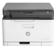
HP Color Laser MFP 178nw