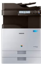
Samsung MultiXpress SL-X3220NR Color Laser Multifunction Printer