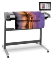
HP HD Pro 2 42-in Scanner