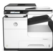
HP PageWide 377dw Multifunction Printer