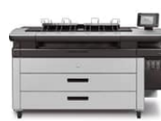
HP PageWide XL 4100 40-in Printer with Top Stacker