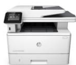
HP LaserJet Pro MFP M426fdn

Fast print, scan, and copy performance in such a small but robust package. This MFP finishes key tasks faster and guards against threats. 4 Original HP Toner cartridges with JetIntelligence give you more pages. 3 F6W13A