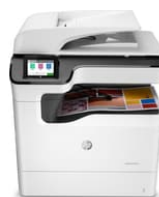
HP PageWide Color MFP 774dn