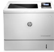
HP Color LaserJet Enterprise M552dn

Get productive print performance – world's smallest colour laser in its class. 7 Print, and scan, produce high-quality colour results, and print and scan from your phone. 6 4ZB95A