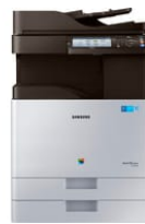
Samsung MultiXpress SL-X3280NR Color Laser Multifunction Printer