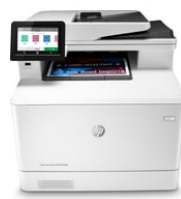
HP Color LaserJet Pro MFP M479fdn