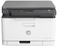
HP Color Laser MFP 178nw

Get productive MFP performance – world's smallest colour laser in it's class. 29 Print, scan, and copy, produce high-quality colour results, and print and scan from your phone. 26 4ZB96A