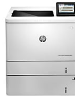
HP Color LaserJet Enterprise M553x

Speed and colour are the perfect pair for your business. That's why this energy-efficient printer and Original HP Toner cartridges with JetIntelligence combine to produce vibrant, professional-quality documents right when employees need them. B5L24A