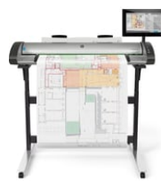
HP SD Pro 44-in Scanner