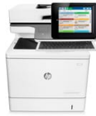
HP Color LaserJet Enterprise Flow MFP M577c

This top-of-the-line enterprise MFP helps streamline workflows and accelerate document tasks with advanced finishing options and file sharing. Give users simple, direct access to this MFP through mobile printing and touch-to-print capabilities 17,30 . A2W76A