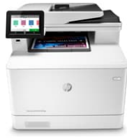
HP Color LaserJet Pro MFP M479dw

Expect brilliant colour prints from advanced MFPs, equipped with JetIntelligence technology. Offering HP's most secure printing 7 and a wide range of paper handling features, this is printing that helps save time and simplifies workflows. T3U55A